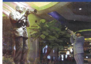
New Orleans - "Birthplace of Jazz"