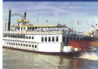
Enjoy a Riverboat Cruise